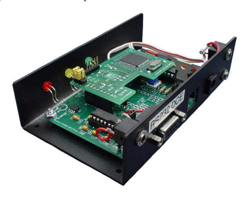
Figure 2. µSmartDigi and TNC-X

If a packet PASSes the Rules a new AX.25 HDLC frame is constructed, then a KISS packets is constructed and lastly it is sent to the serial port of the TNC-X for transmission.